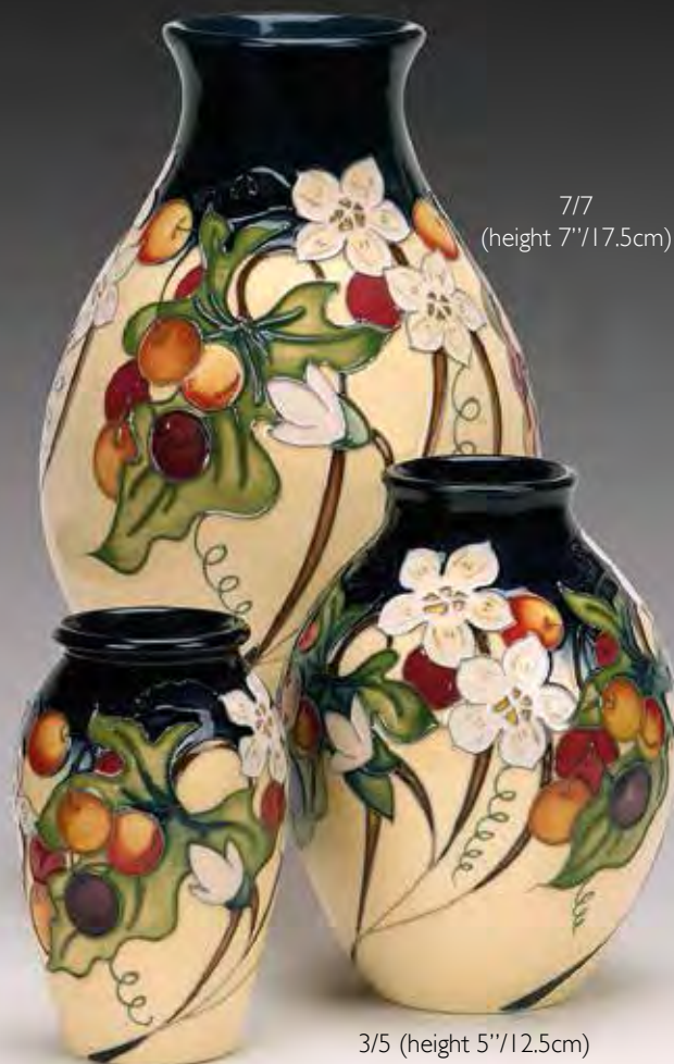
7/7 (height 7"/17.5cm)

It is not the first time that Briony has been the subject of a Moorcroft design, and neither will it be the last. Colourful berries, cream-coloured blossom and curling leaves make Briony Time a festive piece to put into a Moorcroft collection during the art pottery's centennial year. Flowers and fruit are an essential part of the Moorcroft legacy. To reflect the fact, each piece of Briony Time comes as a limited edition of 100 pieces.