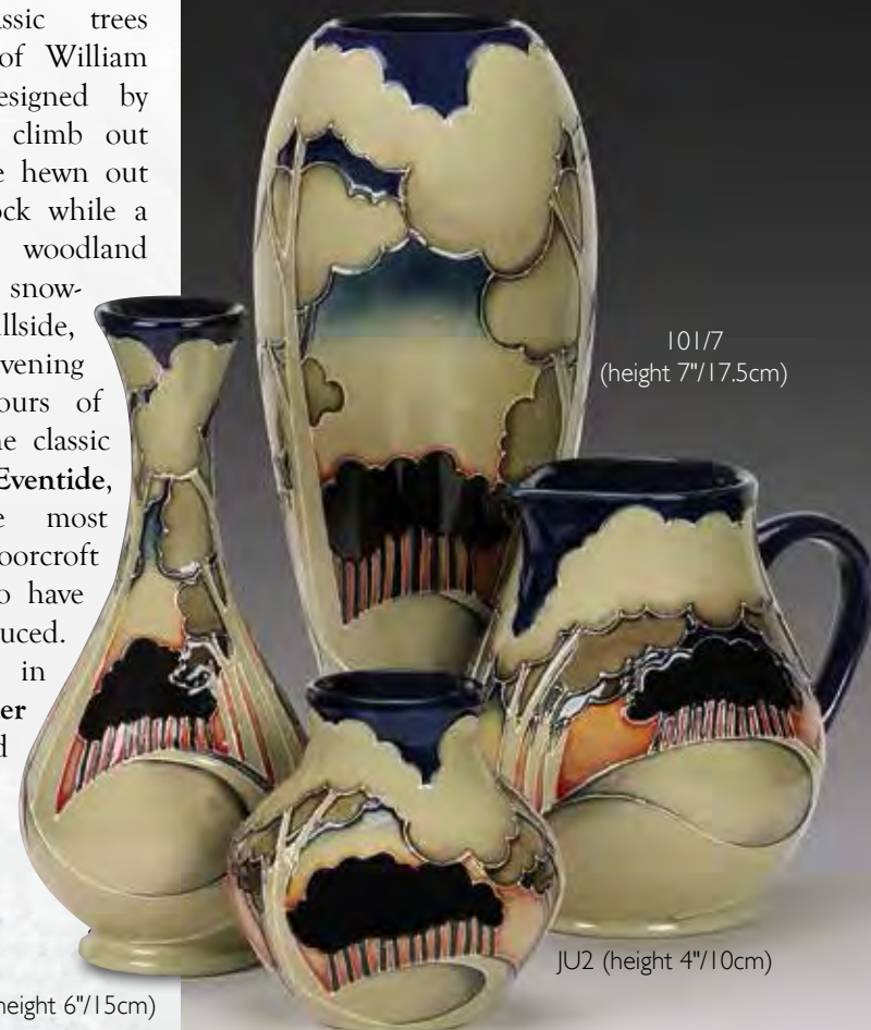
101/7 (height 7"/17.5cm)

Seldom can a group of four small pieces have provoked more comment within Moorcroft than Eventide Winter . Classic trees in the style of William Moorcroft, designed by Vicky Lovatt, climb out of a landscape hewn out of Pennine rock while a stark line of woodland runs down a snow-covered hillside, against an evening sky. The colours of the sky are the classic colours of Eventide , one of the most celebrated Moorcroft designs ever to have been introduced. Each piece in Eventide Winter is a numbered edition.